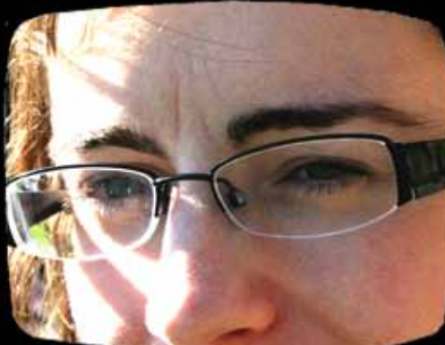
Capture very intimate and emotional effects with an extreme close-up.