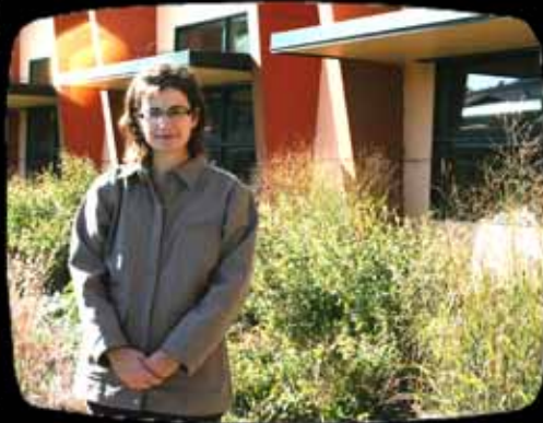
The medium shot captures a standing person waist up.