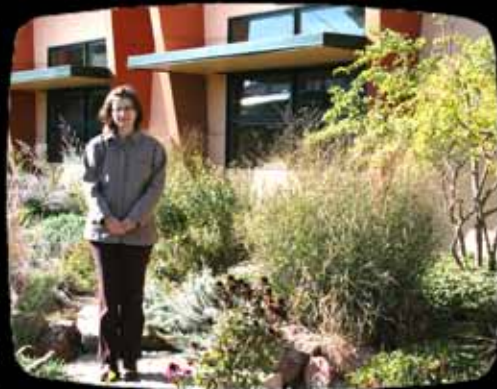
Wide shots provide a panoramic view and set the scene.