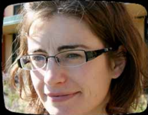
Close-ups connect the subject and viewer and show emotion.