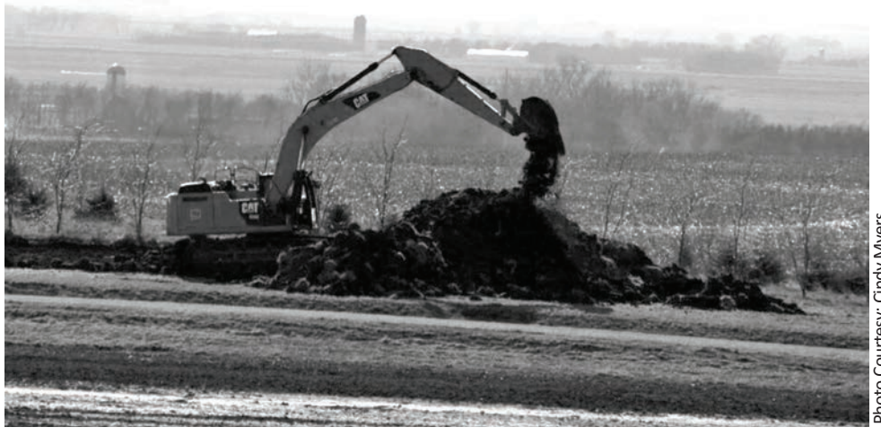
In 2010, the first year of operation, the Keystone I tar sands oil pipeline leaked 35 times. More recently, the pipeline trickled nearly 17,000 gallons in this field near Freeman, S.D.

The pipeline resumed operations April 10 after leaking for more than a week.