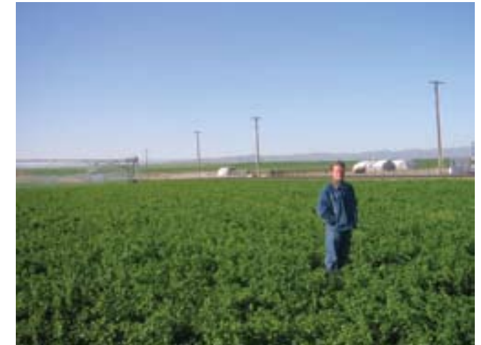
Eckenberg Farms exports alfalfa in the form of hay cubes used in the compound feed industry in Japan and as double-compressed bales in a variety of sizes. Production of hay cubes requires large, complex production, bagging and storage facilities. Making double-compressed bales requires large compressing machines that resize and compress hay to achieve maximum density in ocean-going containers.

According to Brent Evans, international sales manager for Eckenberg Farms, genetically modified (GM) alfalfa raises serious concerns in the alfalfa export industry. "While the Japanese government has approved the sale of Roundup Ready alfalfa," Evans says, "Japan's marketplace, including importers, agricultural cooperatives, and dairymen, does not want to buy Roundup Ready alfalfa."