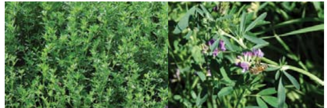
Alfalfa hay fields in full bloom south of Billings, Montana, August 2005. Harvesting was delayed due to rain. Monsanto and Forage Genetics assert that cross-pollination between hay fields is not a threat, even though weather and other factors dictate when hay can be harvested.

The Western Organization of Resource Councils is a regional network of seven grassroots community organizations with 9,500 members and 50 local chapters. WORC's mission is to advance the vision of a democratic, sustainable and just society through community action. WORC wants to ensure consumers' right to know by requiring the clear and accurate labeling of genetically modified foods; protecting the interests of farmers and ranchers who want to grow GM-free alfalfa or feed uncontaminated alfalfa to livestock or dairy cattle; and protecting the interests of consumers who want GM-free foods.