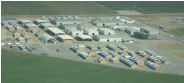
Eckenberg Farms, the largest exporter of alfalfa in the U.S.